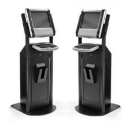
To see the benefits in action or find out more, just get in touch:

For our customers it's a lot more advanced. Genkiosk puts all the information on hand and then helps them see through the data smog with alerts, alarms and reports.